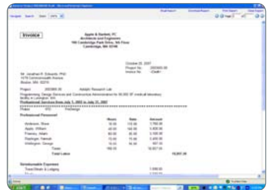
Figure 2: Vision Billing helps you prepare timely and accurate invoices so you can get paid more quickly

Universal access and zero-client install ensure that any user with Internet Explorer can access the system from anywhere at anytime. Other than a web browser, no plug-ins or applets are needed. Vision supports hundreds of concurrent users, yet can be readily scaled down to meet the requirements and resources of smaller organizations.