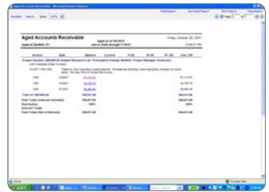
Figure 4: Vision's Aging reports and Aging Alerts keep you on top of outstanding invoices so you can improve cash flow