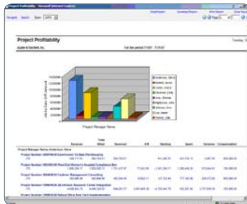
Figure 1: The Office Earnings report gives financial and project managers a high-level summary of financial activity including current, year-to-date and job-to-date totals. Use it to determine what project managers are making or losing money, what type of work is most profitable, view profitability of department and more.